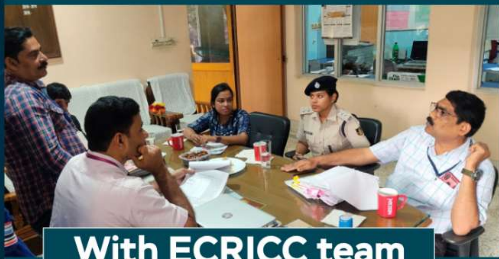
With ECRICC team