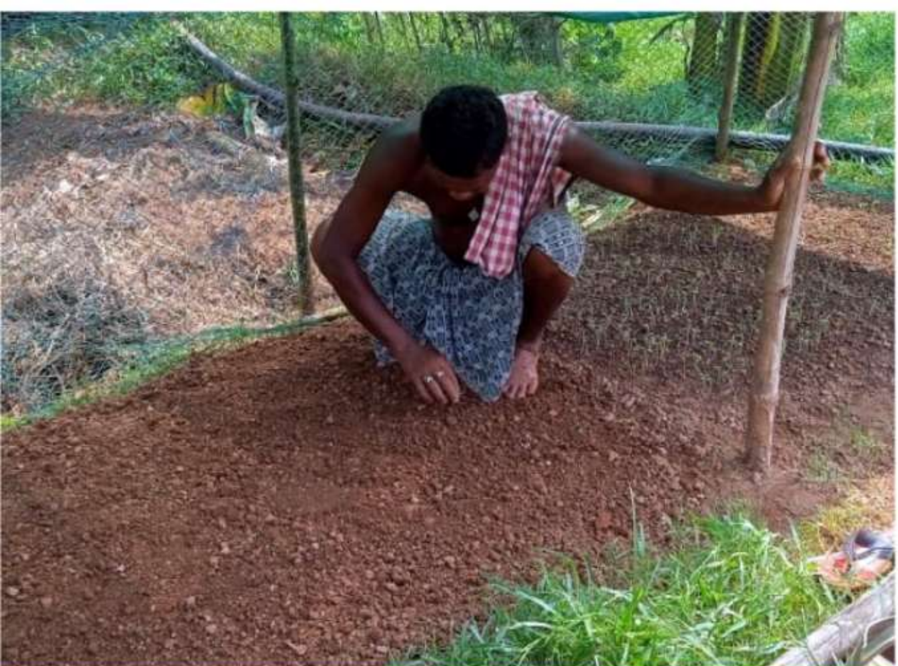
Nursery Bed, Seed and Seedling Treatment