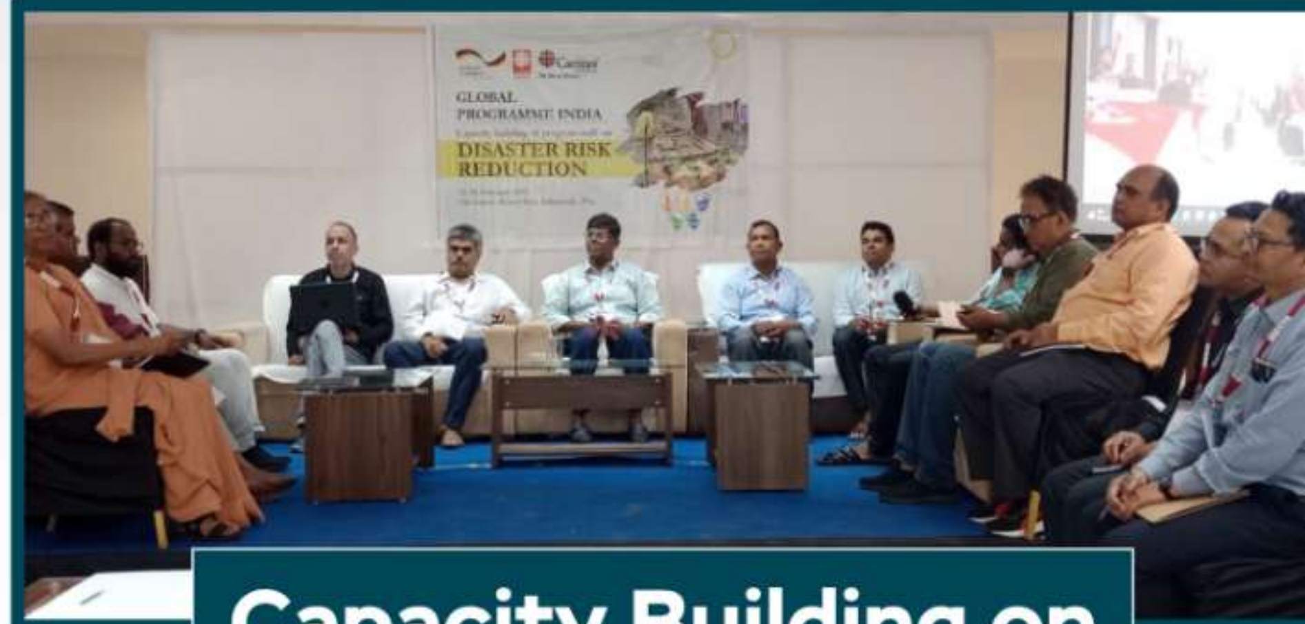
Capacity Building on DRR by Caritas India