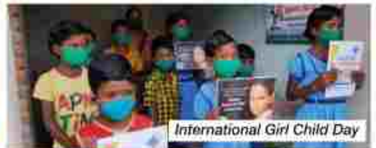
International Girl Child Day