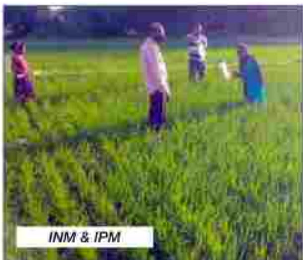
INM & IPM