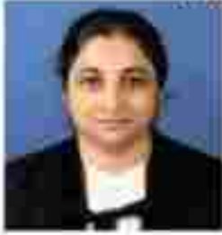
Prajwala - State level Training Coordinators: