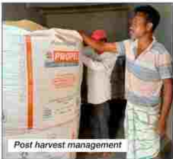
Post harvest management