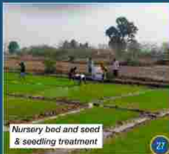
Nursery bed and seed & seedling treatment