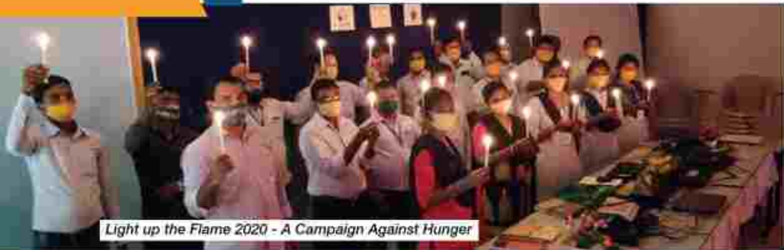
Light up the Flame 2020 - A Campaign Against Hunger