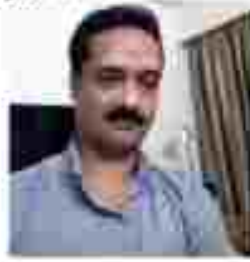
Prajwala - State level Monitoring Coordinator