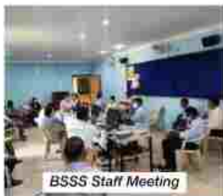
BSSS Staff Meeting