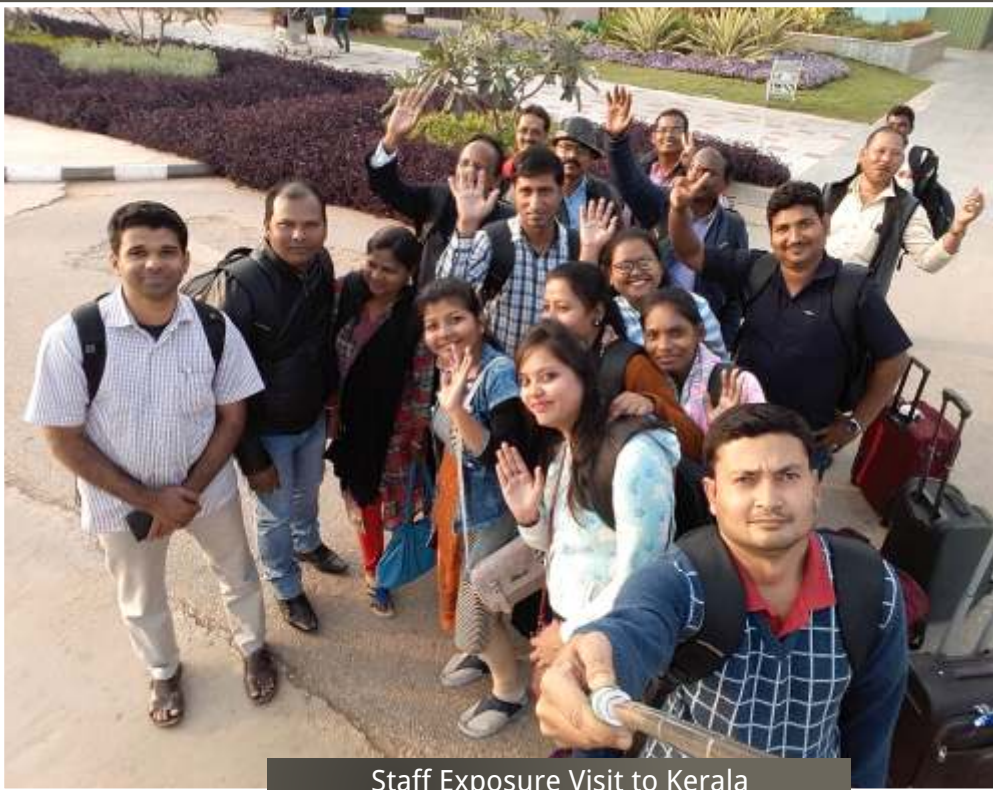
Staff Exposure Visit to Kerala