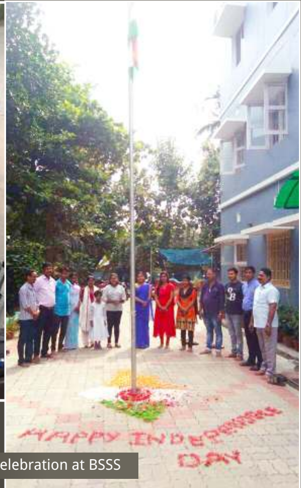
Independence Day Celebration at BSSS