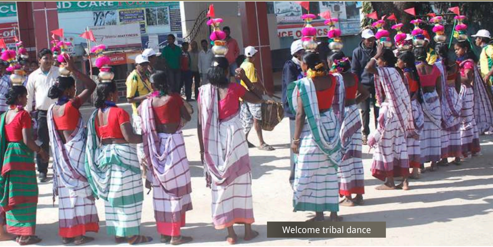
Welcome tribal dance