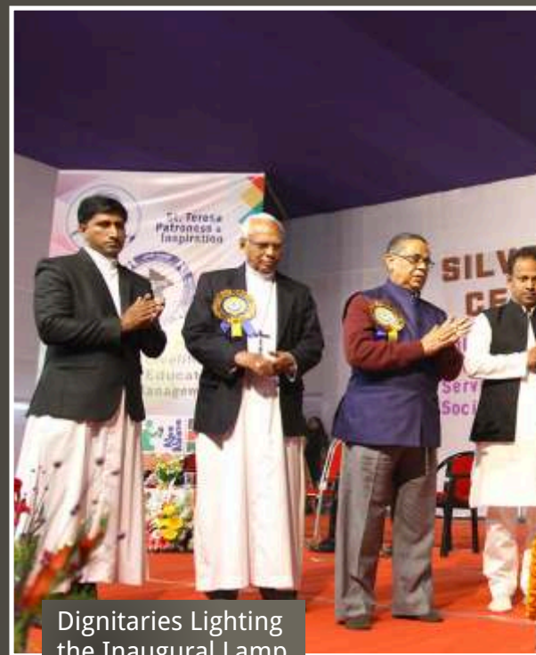
Dignitaries Lighting the Inaugural Lamp