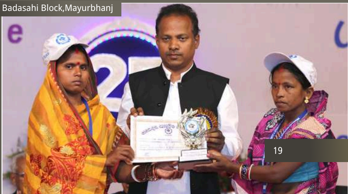
Best SHG of Badasahi Block, Mayurbhanj

There was BSSS alumni gathering at BSSS office in the morning, when the seminar took place at St. Vincent Convent School Campus. There were around 35 participants who worked in BSSS in early years who