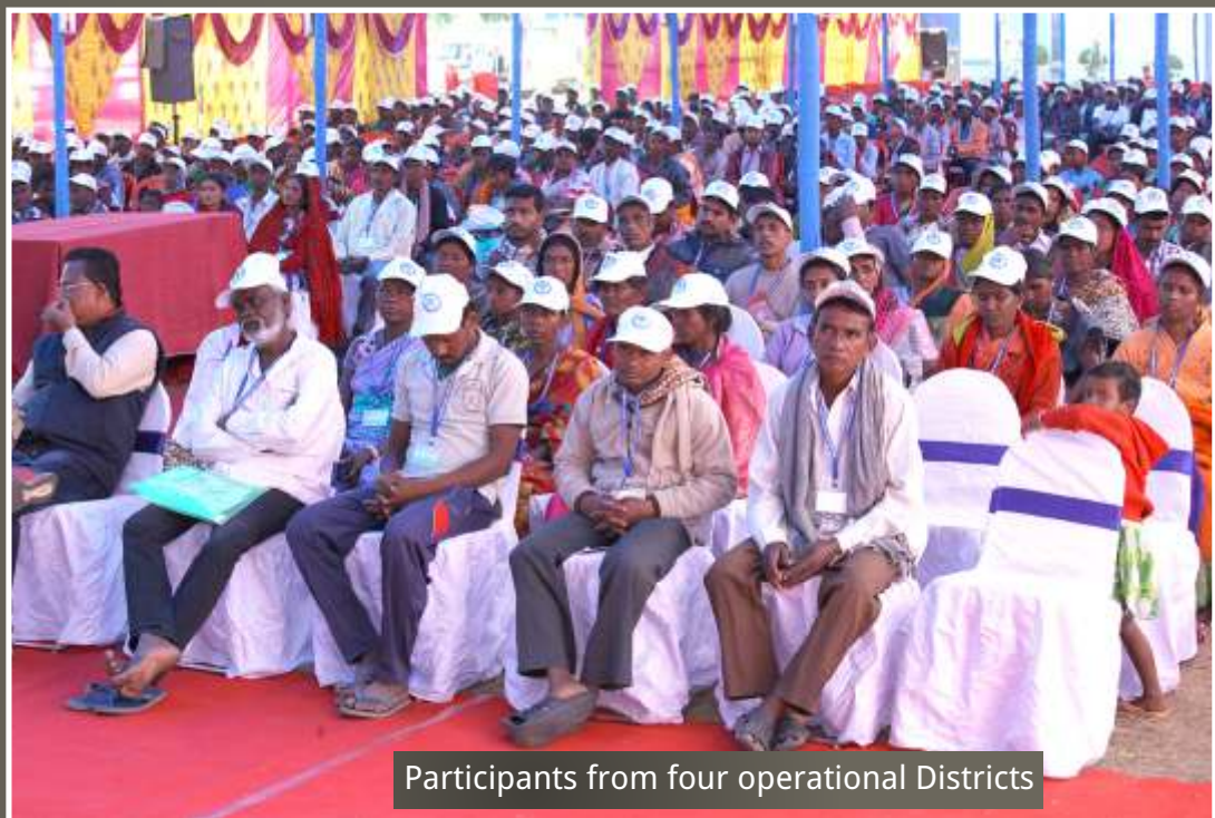
Participants from four operational Districts