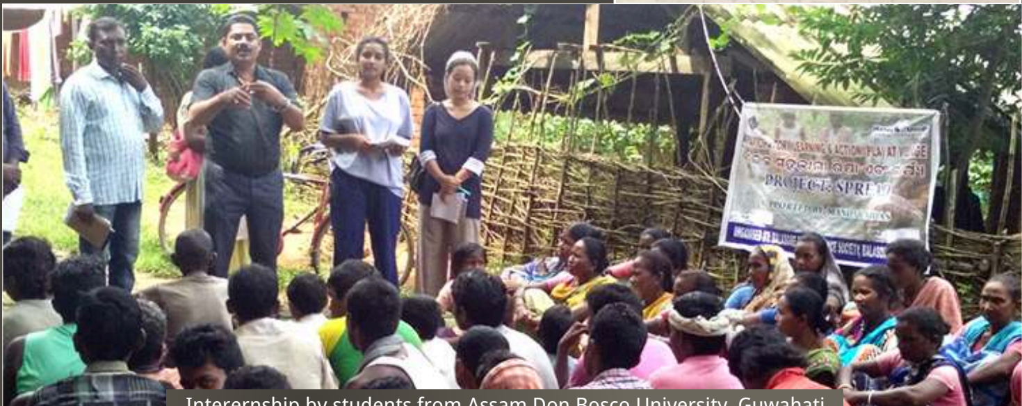
Interenship by students from Assam Don Bosco University, Guwahati