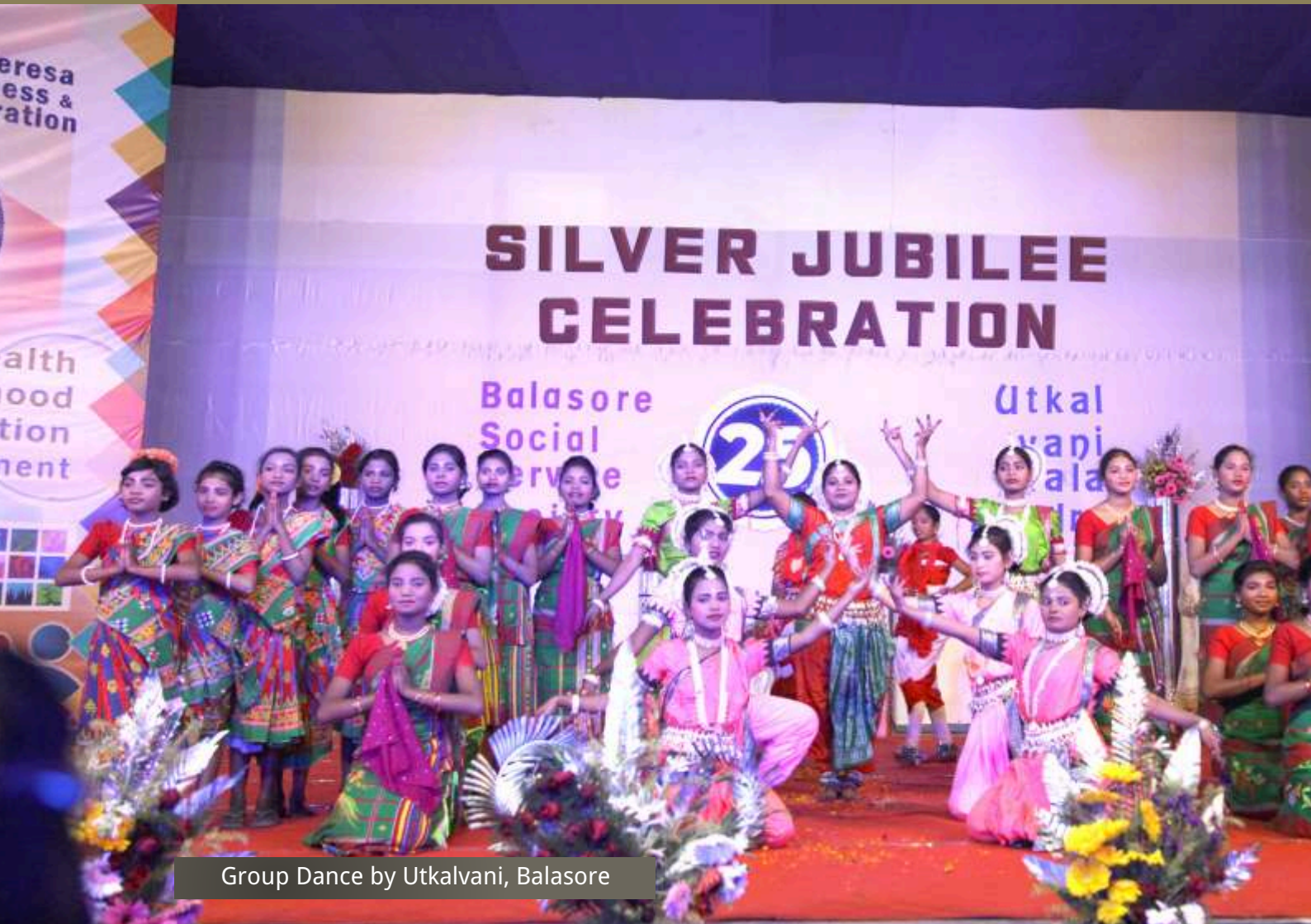
Group Dance by Utkalvani, Balasore

Jubilee is a joyful and jubilant occasion to recognize the innumerable blessings, mercies and graces of the Almighty. It is a unique opportunity to glorify the name of God and praise him for his wonderful intervention in our life. It is a time to pause, to ponder, to re-energize and to re-dedicate one's life for the fruitful service of the humanity. For BSSS 2016-17 was the silver year which was inaugurated on 22 November 2016 at its legal establishment as Balasore Social Service Society and the culmination of the Jubilee was on 27 December 2017.