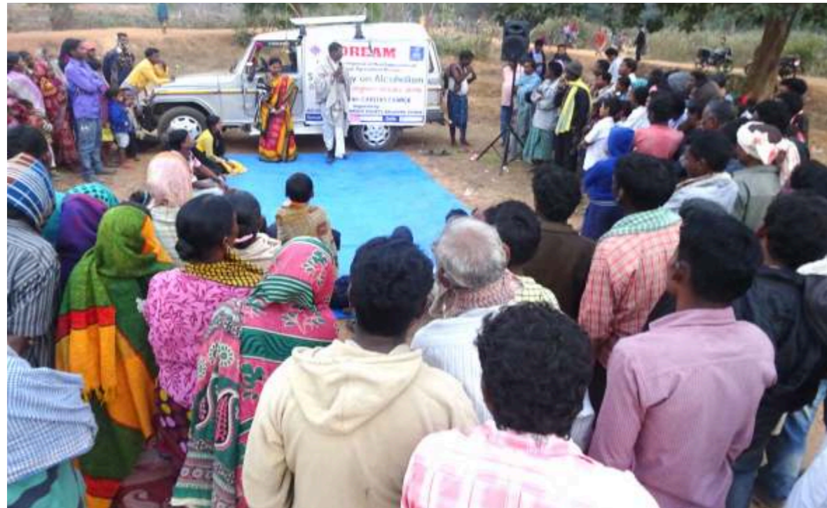
The DREAM project is implemented in Baripada Sadar & Kuliana blocks of Mayurbhanj district. It covered 25 villages in 2 panchayats impacting the lives of 2,978 families.

The DREAM project aims to address food insecurity among communities in Keuntinimari and Betna gram panchayat by increasing food availability and improving access to food through increased agricultural productivity and enhanced income generation