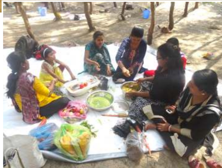
MOMENTS FROM BSSS ANNUAL PICNIC 2016