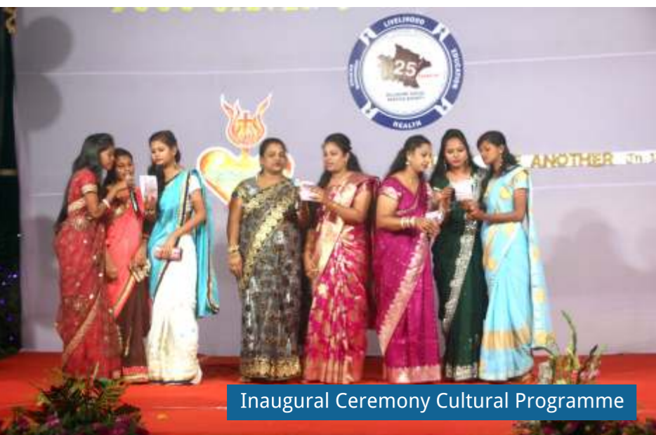
Inaugural Ceremony Cultural Programme

BSSS is planning to have the silver jubilee celebration with all its partners, stakeholders and friends in the month of December 2017. So we shall come to you with a special edition of Annual Report in the coming year, 2017-18.