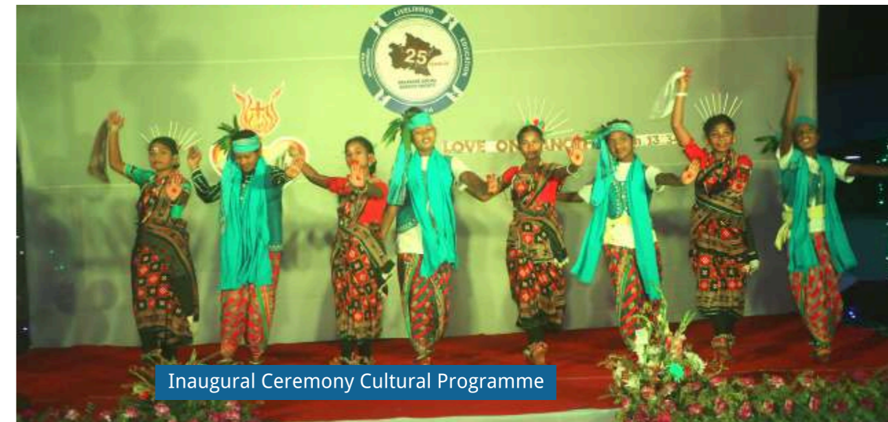
Inaugural Ceremony Cultural Programme