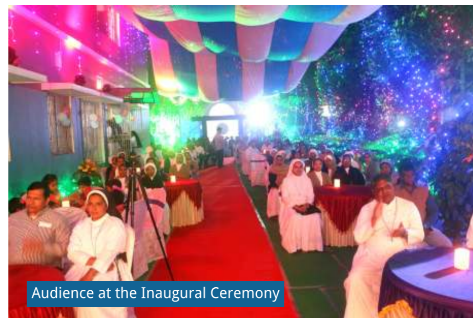
Audience at the Inaugural Ceremony