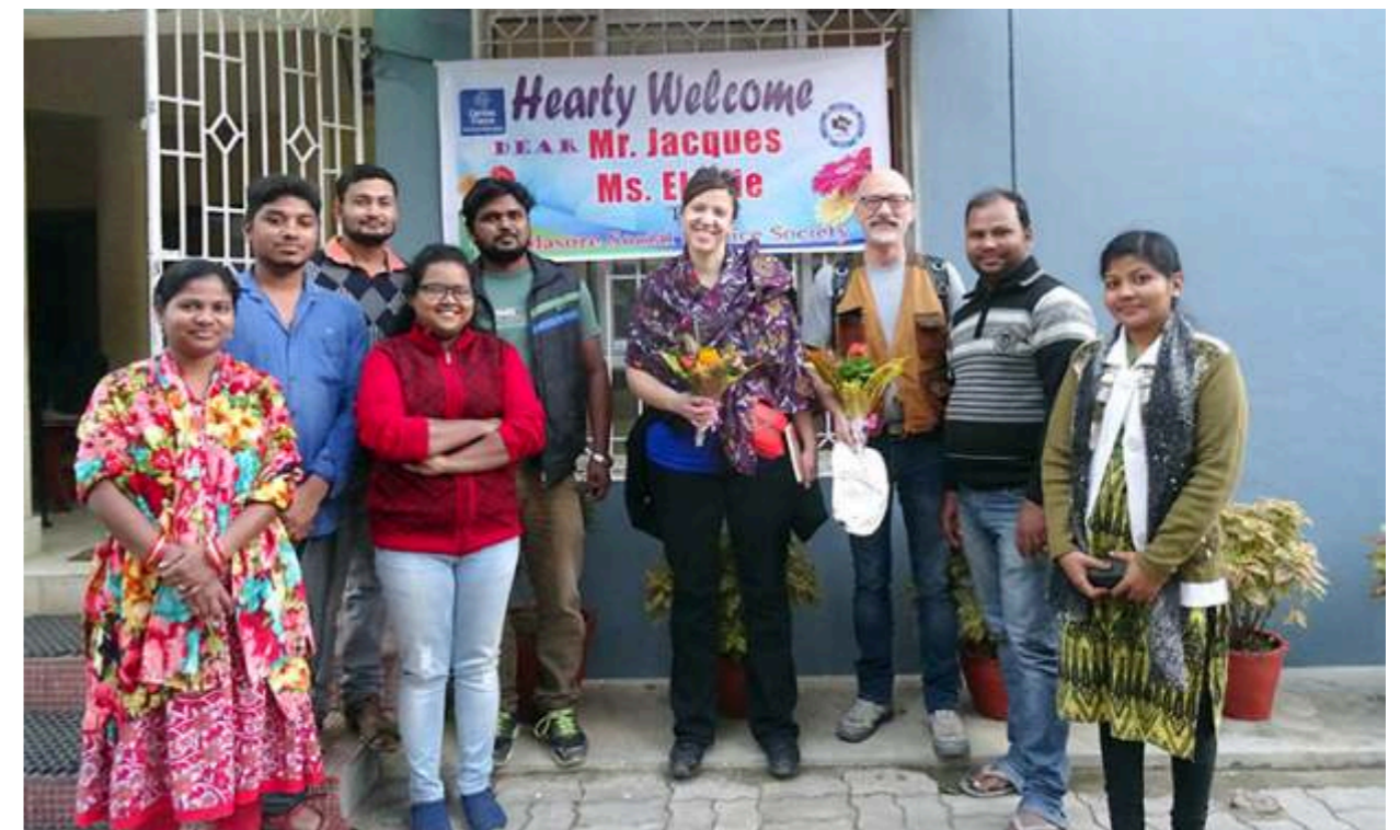
VISIT BY CARITAS FRANCE DELEGATES